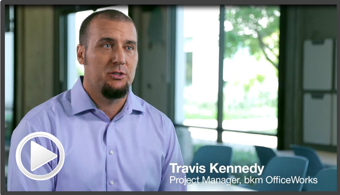
Click Play Button to view the video case study by Steelcase & bkm