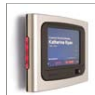
Lights indicate room usage or availability