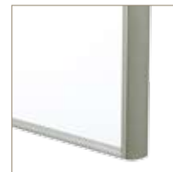
Edge Premium Whiteboard