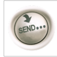
One-Click-Publishing note capture and distribution